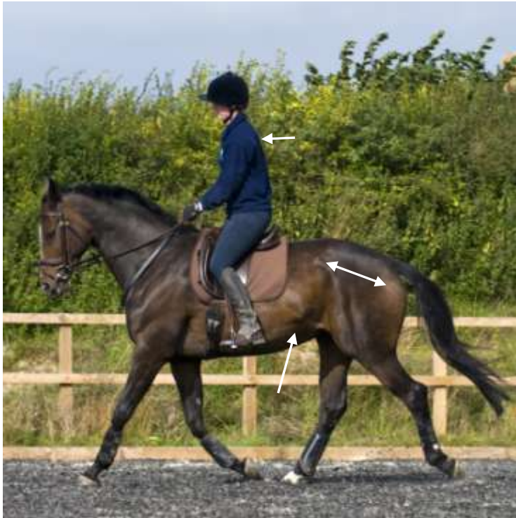
Figure 2: Young Horse being ridden with correct head and neck position. Note: the rider is slightly leaning forward to encourage the horse's back to lift using the horse's core group of muscles. When the horse is stronger and in better balance the rider can then sit more upright in a correct position. Notice the angle of the pelvis as the hind legs are engaged.

However, in a tense high head and neck position, the core muscle group are inhibited so engagement and correct back posture is lost, (see Figure 3).