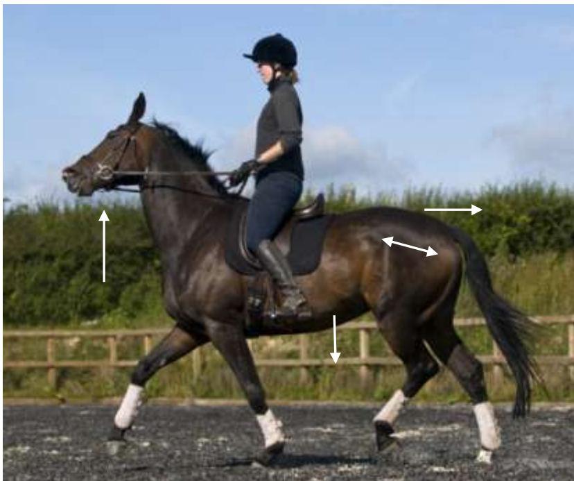
Figure 3: the same horse in a moment of resistance. The head and neck are very high, the ventral chain has slackened and the sub lumbar muscles have changed the angle of the pelvis so the hind quarters are disengaged.

However, in a tense high head and neck position, the core muscle group are inhibited so engagement and correct back posture is lost, (see Figure 3).